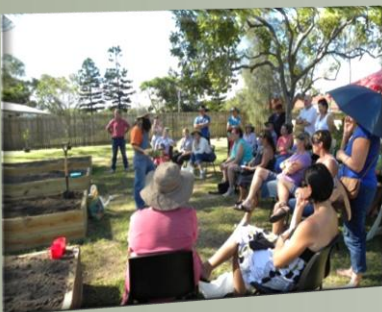
A very keen group learning about planting green manure

Don't forget to check the Notice Board to see what Activities are happening at the Hub as these can change during the month: